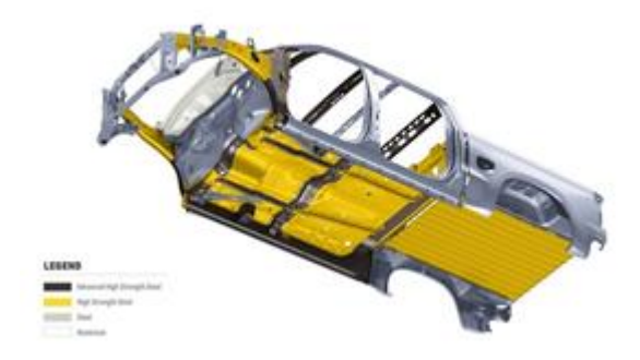
U.S. Steel Corporation Martensitic Advanced High Strength Steel (Mart-Ten™1500)