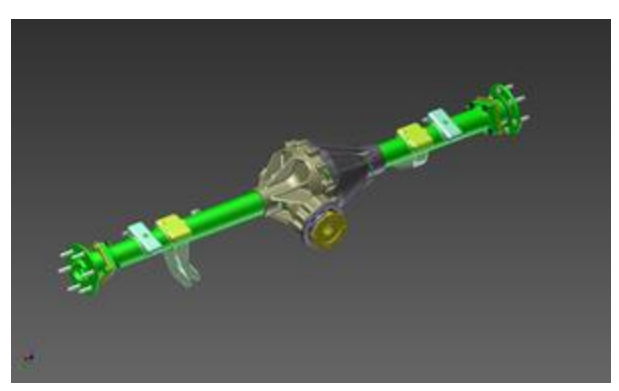
AAM Quantum Driveline Architecture

The winner in the Full Vehicle category was General Motors' 2019 Chevrolet Silverado, which weighed in at an impressive 450 pounds (204.5 kilograms) lighter than its predecessor. BMW Group claimed the Module category with the first 3D printed metal component used in a production series vehicle, which captured a 44% component weight savings on the 2018 BMW i8 Roadster. Asahi Kasei Corporation's Super Lightweight Pedal Bracket for the Mazda MX-5, Sika Automotive's Ultra Lightweight Constrained Layer Material System, and United States Steel Corporation's Martensitic Advanced High Strength Steel, Mart-Ten™ 1500 took the top honors in the Enabling Technology category. The award for the new Future of Lightweighting category, chosen by MBS attendees, went to American Axle & Manufacturing, Inc. (AAM) for its Quantum Driveline Architecture program.