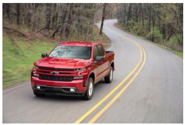
General Motors 2019 Chevrolet Silverado

TROY, Mich., July 30, 2018 (GLOBE NEWSWIRE) -- <u>Altair</u> (Nasdaq: ALTR) and the Center for Automotive Research (CAR) have announced the winners of the 6<sup>th</sup> annual <u>Altair Enlighten Award</u> today at the <u>2018 CAR Management Briefing Seminars (MBS)</u> in Traverse City, Michigan. The Altair Enlighten Award honors the greatest achievements in vehicle weight savings each year. Inspiring interest from industry, policymakers, educators, students and the public, the award incentivizes automotive lightweighting advancements and provides a global platform to recognize and share technological achievements. The award is judged by an independent panel of automotive industry experts, academia and the engineering media who selected 6 winners from a field of 57 finalists this year.