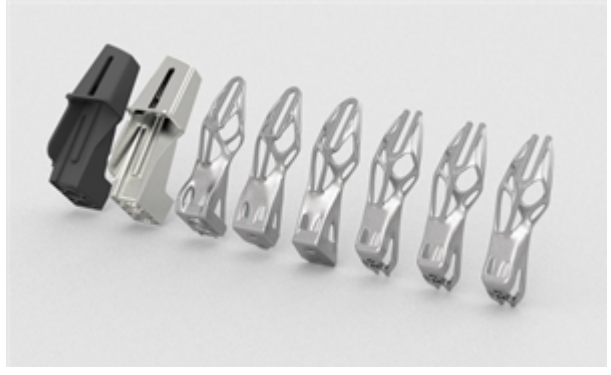
BMW Metal 3D Printed Convertible Roof Bracket