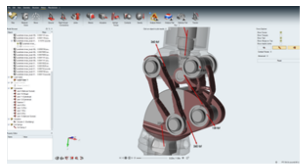
Altair Inspire - The Future of Simulation-Driven Design

http://www.globenewswire.com/NewsRoom/AttachmentNg/1245788e-7699-4dac-a9ae-b0647f2ae8bd