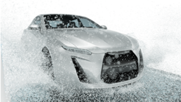
Altair nanoFluidX's GPU-based solution enables blazing fast simulation of complex phenomena like water wading

TROY, Mich., June 03, 2020 (GLOBE NEWSWIRE) -- Altair , (Nasdaq: ALTR) a global technology company providing solutions in product development, high-performance computing (HPC), and data analytics, today announced the most significant software update release in the company's history. All of Altair's software products have been updated with advancements in user experience and countless new features, including intuitive workflows that empower users to streamline product development, allowing customers to get to market faster.